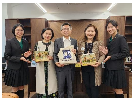
▲ 圖八 學姊與校長互贈禮